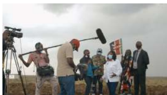
OUR LAND, OUR FREEDOM Produced by: Twende Films (United States), Afrofilms International (Kenya), Muiraquitã Filmes (Portugal) Directed by: Meena NANJI & Zippy KIMUNDU