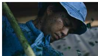
THE SHAPE OF BLUE Produced by: Intuitive Pictures inc. (Canada) Directed by: Sybilla PATRIZIA