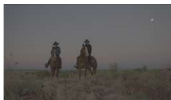
YURLU COUNTRY Produced by: Illuminate Films (Australia) Directed by: Yaara BOU MELHEM